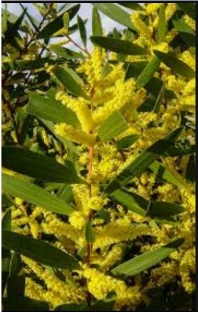
Coast wattle - Acacia sophorae : grows 3 metres. Dense foliage good in sandy soils.