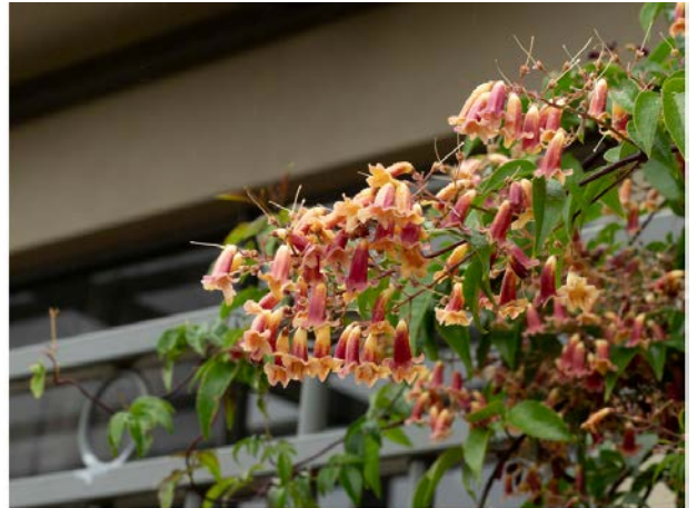
Pandorea 'Golden Showers'

Golden guinea flower - Hibbertia scandens : Low scrambling vine. Large golden yellow flowers throughout the year.