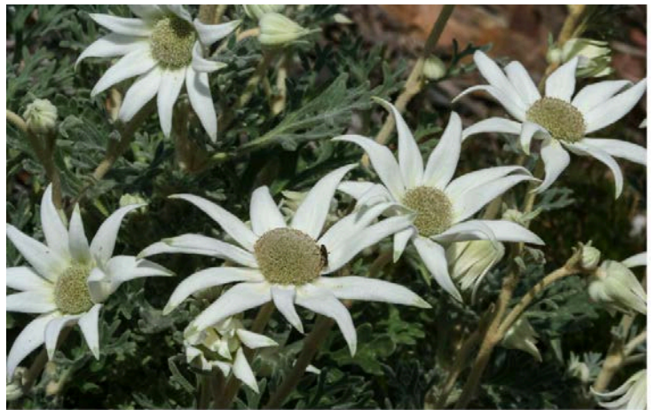
Actinotus helianthi

Flannel flower Actinotus helianthi : Wyong floral emblem. Does best in low nutrient sandy soil. Compact forms available.