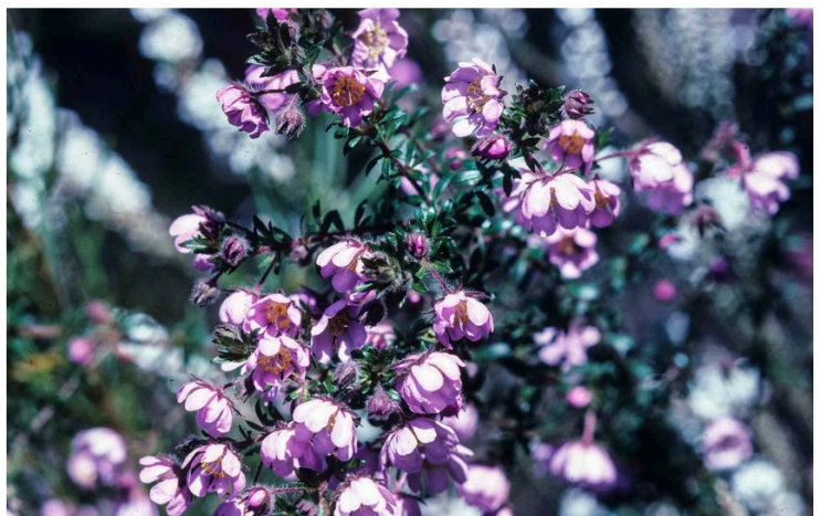
Bauera rubioides

Dog rose - Bauera rubioides : 1 metre. Long flowering. Prefers semi-shade and moist conditions.