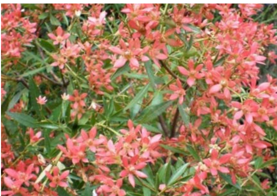
NSW Christmas bush - Ceratopetalum gummiferum : Grows 5 metres. Spectacular ornamental tree with pink/red bracts after flowering mid-summer