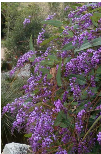
Hardenbergia violacea

Native violet - Viola hederacea : Ground cover. Very hardy. Useful as a spreading cover in wet areas or under trees.