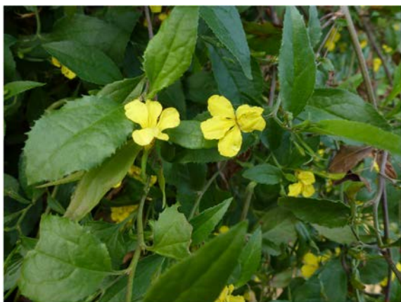
Goodenia ovata

Hop Goodenia - Goodenia ovata : 1 metre. Yellow flowers. Hardy and long flowering in semi- shade.