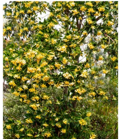
Hymenosporum flavum tree

Willow bottlebrush - Callistemon salignus : grows 3 - 5 metres. Flowers vary in colour from the creamy yellows to the pink reds