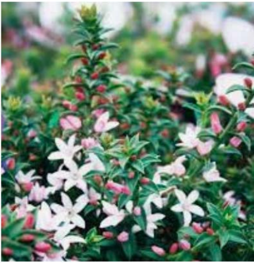
Box leaf wax flower Philotheca buxifolius : syn.

Eriostemon buxifolius . 1 metre. Clusters of pink and white star flowers in late winter and spring. Needs well drained sandy soil.