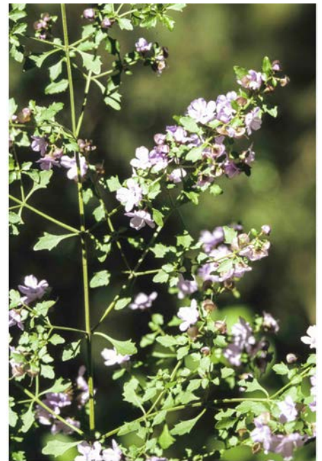
Prostanthera incisa var sieberi

Cut-leaf mint bush - Prostanthera incisa: 1 metre. Aromatic foliage. Profuse mauve flowers in spring.