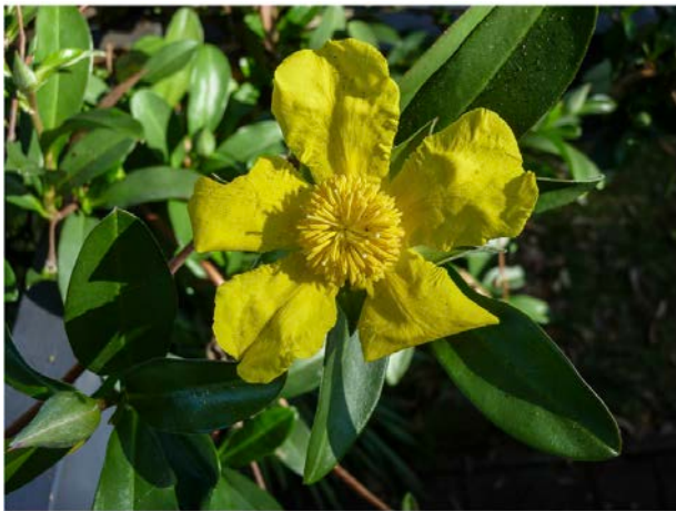
Hibbertia scandens

Wonga vine - Pandorea pandorana : Vigorous climber. Cream flowers in spring. Many cultivars available.