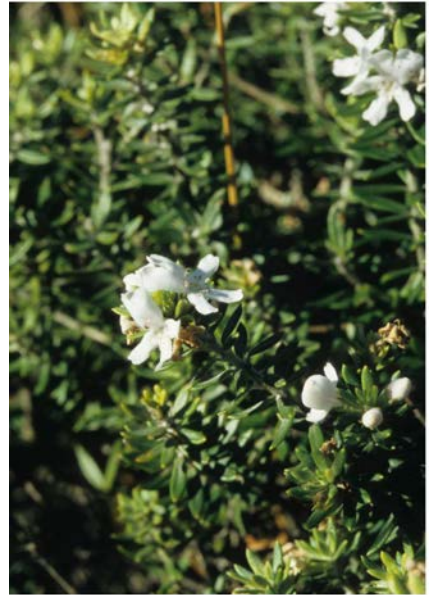
Westringia fruticosa

Coast rosemary - Westringia fruticosa : grows to 1 metre. White flowers. Hardy and drought resistant. Needs tip pruning