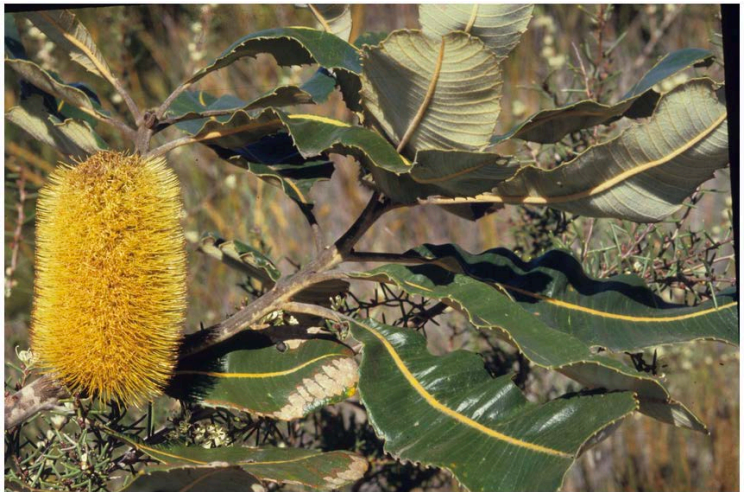
Banksia robur

Swamp Banksia- Banksia robur : 3 metres. Bright bottle green banksia flowers. Best in swampy ground.