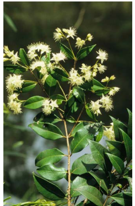
Backhousia myrtifolia , image Alan Fairley