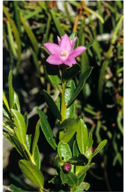
Crowea saligna

Crowea saligna: up to 1.5 metres. Pink star shaped flowers. Thrives in semi-shade and moist conditions.