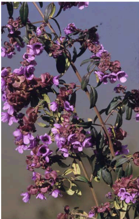
Prostanthera ovalifolia

Prostanthera ovalifolia: 1 metre. Dark green fragrant foliage. Profuse mauve flowers in spring.