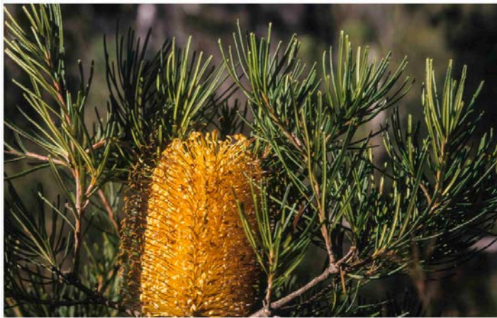
Banksia spinulosa var spinulosa

Hairpin Banksia - Banksia spinulosa : 2 metres. Spectacular banksia brushes with black styles. Full of bird attracting nectar. Cultivar 'birthday candles' is a compact form to 600mm